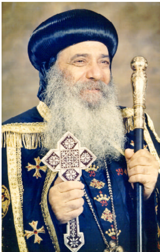
His Holiness Pope Shenouda III Patriarch of the See of St Mark